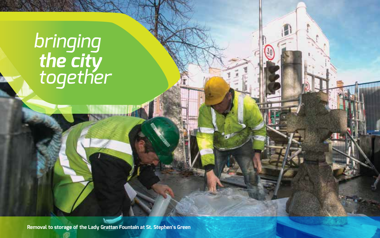
Removal to storage of the Lady Grattan Fountain at St. Stephen's Green

Construction on Luas Cross City (LCC) commenced in June 2013. The LCC is an extension of the Green Line which will create an interchange with the Red Line on O'Connell St. and will be 5.9km in length. There will be 13 new stops, 8 of which will be in the city centre and passengers will travel from Cabra into St. Stephen's Green in 21 minutes. It is scheduled to be operational by the end of 2017 and will enhance the public transport options for city of Dublin and surrounding areas. At a cost of €368 million euro it is the single largest capital investment project in recent years.